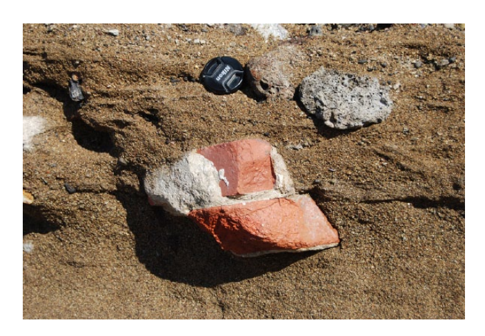
Figure 1. Bricks and concrete fragments in carbonate-cemented beach rock deposits on the Tunelboca geosite, Basque region, Spain.

Buildings – solid, complex but hollow, air-filled structures – following demolition or destruction can be compacted into a solid layer comprising the brick, concrete, glass, metal, plastic, ceramic, wood and other materials used in architecture. Such demolition is intrinsic to ongoing redevelopment of urban space to maintain its functionality. This demolition can at times be abrupt and widespread, as happened to much of Britain's bomb-damaged housing stock after the Second World War (Saunders, 2005), for instance in Longford Park by Coventry, where part of the valley was filled with 4–6 m of demolition rubble. Equivalent war-derived rubble in Berlin was redistributed in mounds within the city boundary. Fourteen such mounds still exist, the largest being the Teufelsberg hill (Figure 2), comprising Anthropocene rubble up to 80 m thick, with an area of 1.1 million m² and an original rubble volume of 26.2 million m³ (Cocroft and Schofield, 2012; Mielke, 2011). Much contemporary armed conflict, too, is characterized by urban warfare, involving extensive destruction of built structures and redistribution of the resulting rubble.