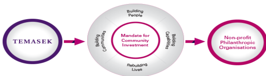
Figure2: Temasek Foundation model of development 124

Singapore's Social development concerns go beyond Singapore into Asia and this is factored in the way the community engagement is designed. The Temasek Foundation focuses on initiatives in Asia while the Temasek cares focuses on initiatives within the Country. This is in line with the Singapore's overall objective of more active engagement in Asia.