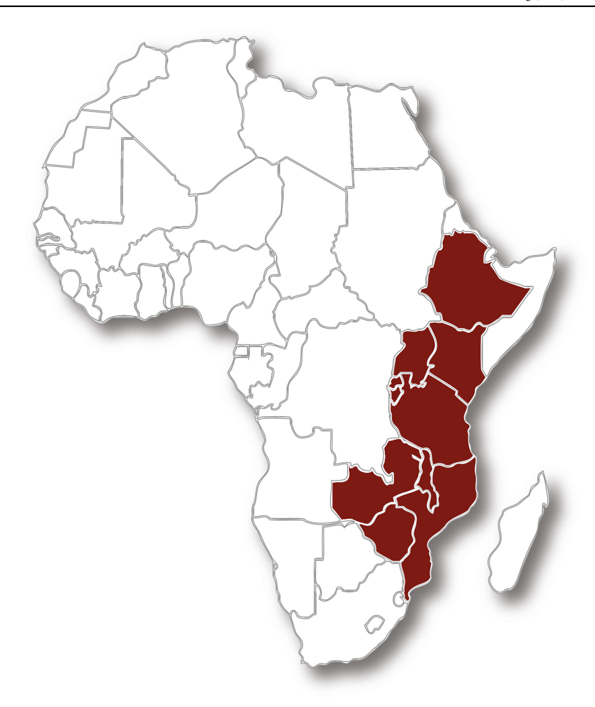
Fig. 1 Map of the COSECSA region

The database now contains an individual profile of every surgeon living and working in the region. The data are updated on a regular basis and the data in the current publication were finalised on 8th December 2015.