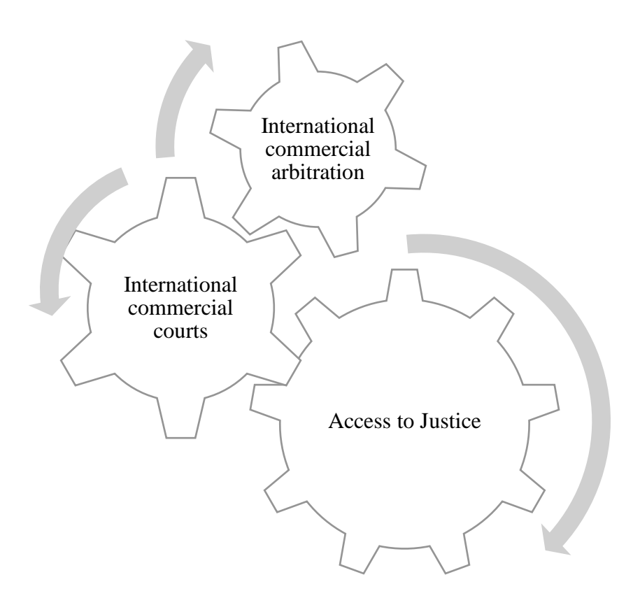
Fig 1: Conceptual interplay between international commercial arbitration, international commercial courts and the right of access to justice<sup>55</sup>

This section has presented the conceptual framework guiding this study. The key concepts have been illustrated to show the guiding mind-set of the study. The concepts of international commercial arbitration co-existing with international commercial courts are presented as joint contributing factors to realising the right of access to justice.