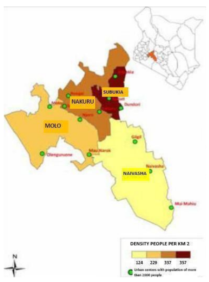
APPENDIX II: MAP OF NAKURU COUNTY