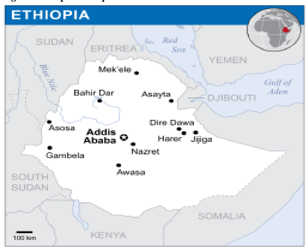
Figure 3.1 map of Ethiopia.

AWSAD is engaged in three programs namely safe house, training and skill development. The Safe house provides a transitional shelter for survivors of violence and their children by providing them with holistic service in terms of temporary shelter, medical service, counselling, legal follow up, skill training and basic literacy education. AWSAD has two safe houses in Addis Ababa established in 2006 and in Adama established in 2011. The other program focuses on the provision of trainings and capacity building to enhance the capacity of community and government institution in providing quality services for women and girls. The third program is that of the skill development which targets women and girls survivors of physical and psychological harm as well as women with low income.