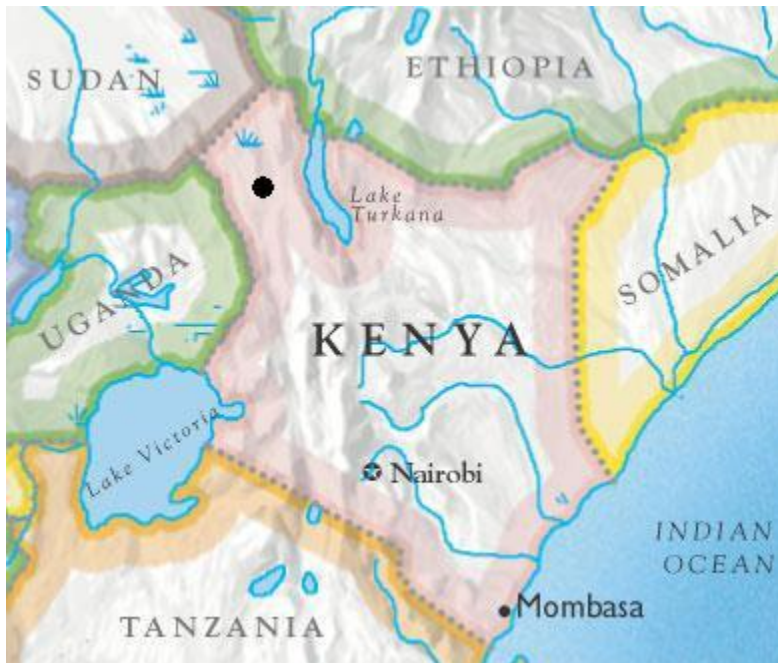
Map of Kenya –Source, Google map 2017.