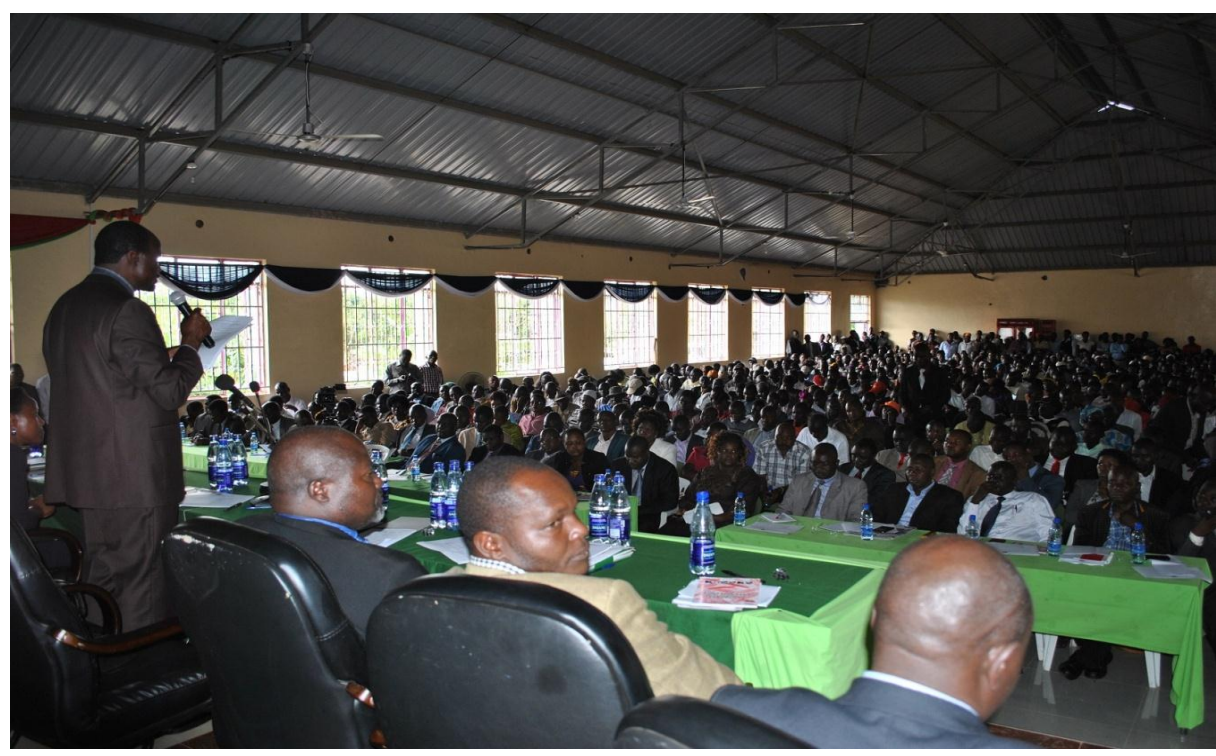
Figure 3: Public participation meeting in Migori County