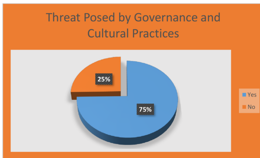
Fig 4.2 Threats posed by governance systems and cultural practices in interstate relations.

In support of the above findings, respondents indicated that officials or persons who are expected to be conversant with the subject matter did not provide much information. The researcher did not find evidence of official governance structures or cultural practices that constrain the relationship between Kenya and Eritrea. Nonetheless, the findings from the interview indicated that the domestic and external interface of a country by far determines its