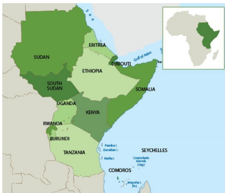
Figure 1: Map of Eastern Africa Countries 92

to EAC, the three countries are also members of various regional bodies. There is the Southern African Development Community (SADC) in which Tanzania is a member. Kenya and Uganda are also members of COMESA and IGAD. There is also the Indian Ocean Rim-Association for regional cooperation (IOR-ARC) in which Kenya and Tanzania is members. The membership to several economic blocks and integrations has created challenges to member countries, mainly caused by trade agreements and overlapping interests. Inter alia origin criteria have also raised more challenges for these integrations. 91