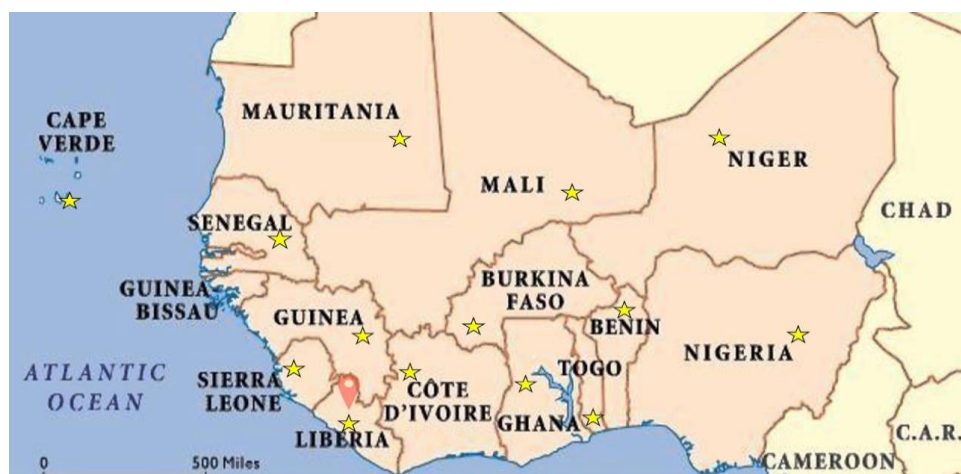
Figure 2: Map of West Africa Countries 99

The main objectives of IGAD were at first built on economic development. However, the Agreement of the IGAD through its Assemblies of Heads of States and Governments also identified the need for promotion of peace and stability in the sub-region, and initiate mechanisms within the region for the prevention, management and resolution of both the intra-state and inter-state conflicts and insecurity thorough dialogue; and to facilitate repatriations and reintegration of refugees, returnees and displaced persons and demobilized soldiers. The Agreement also mandated the member states of IGAD to tackle disputes within the sub-region before it escalates into violence, and before involving other regional or international organizations (Ibid, pg.364).