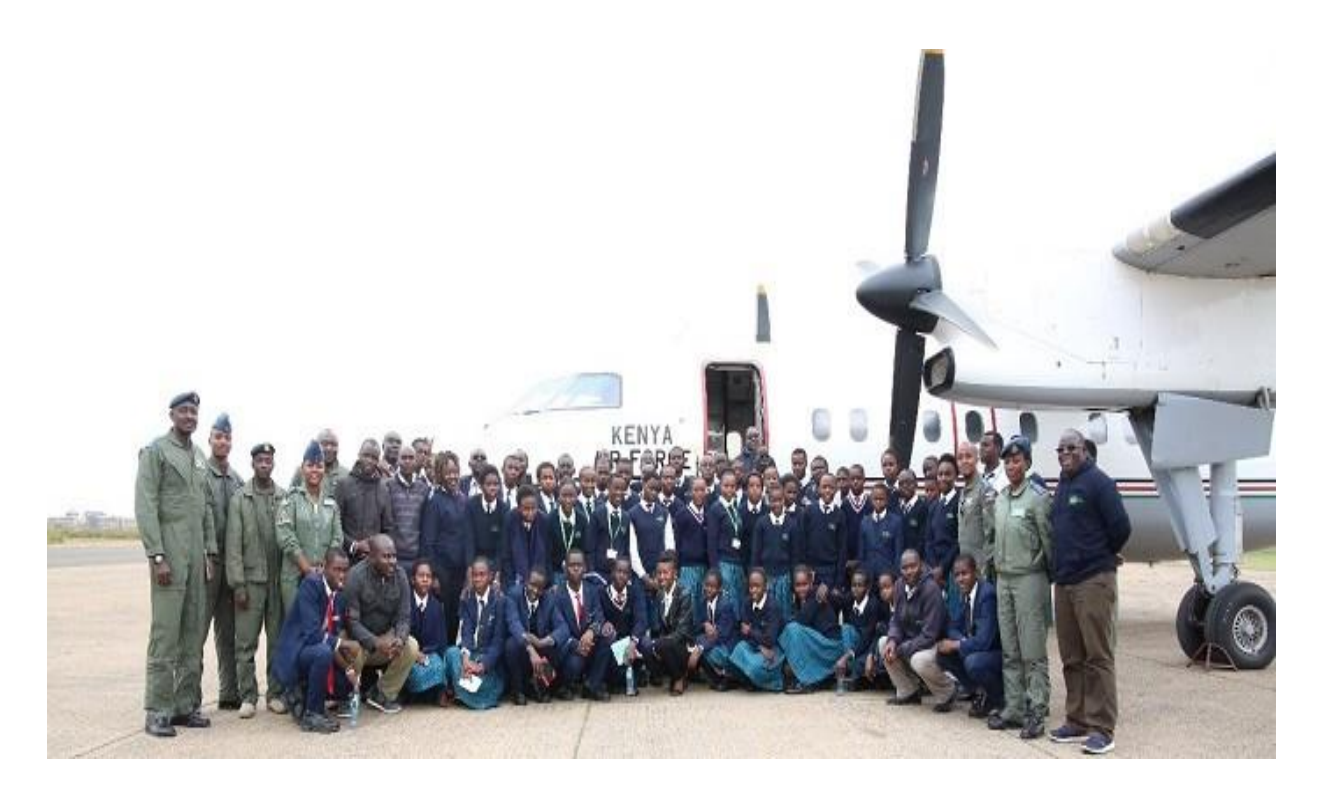
Fig.1 M-pesa Foundation Academy students pose for a photo with Kenya Air Force personnel at Moi Air Base during their visit at the base.