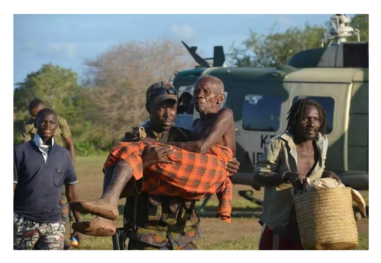
Fig 4. Kenya Air force soldier carrying an elderly man in his arms away from floods. 3.3.4 Environmental Stewardship

This deals with the responsibility to use and protect the natural environment by the application of proper methods of conservation and sustainable practices. Environmental concerns are a greater part of KDF's CSR. This is because of the effects of military installations on the environment. The aspect of training, testing armory and the net effects of confining a large group of military individuals and their families within a restricted environment often impact negatively on the environment. As a result, the KDF has taken it upon themselves to protect the environment, not only where the bases are located, but also in other areas that represent greater national interests like water catchment areas, forests among others.<sup>98</sup>