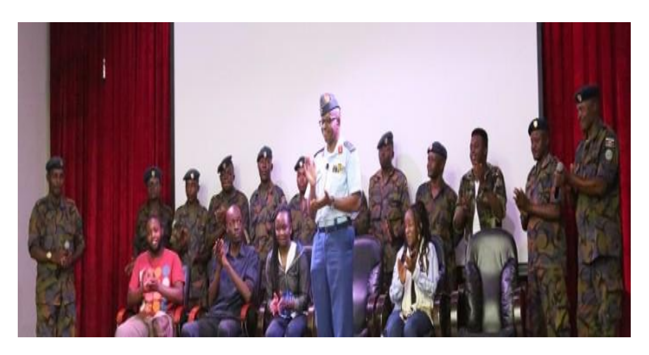
Fig. 3 Commander, Kenya Air Force Major Gen Samuel Thuita with the "WatuWote" short Film

"I challenge all of us to learn from this short film and realize that no matter where we come from, as Kenyans we need each other. Let us reject all forms of discrimination and religious separation and continue to look out for each other."