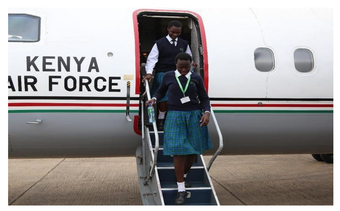
Fig 2. M-Pesa Foundation Academy students disembark from Dash 8 Aircraft after their airexperience in the Aircraft.