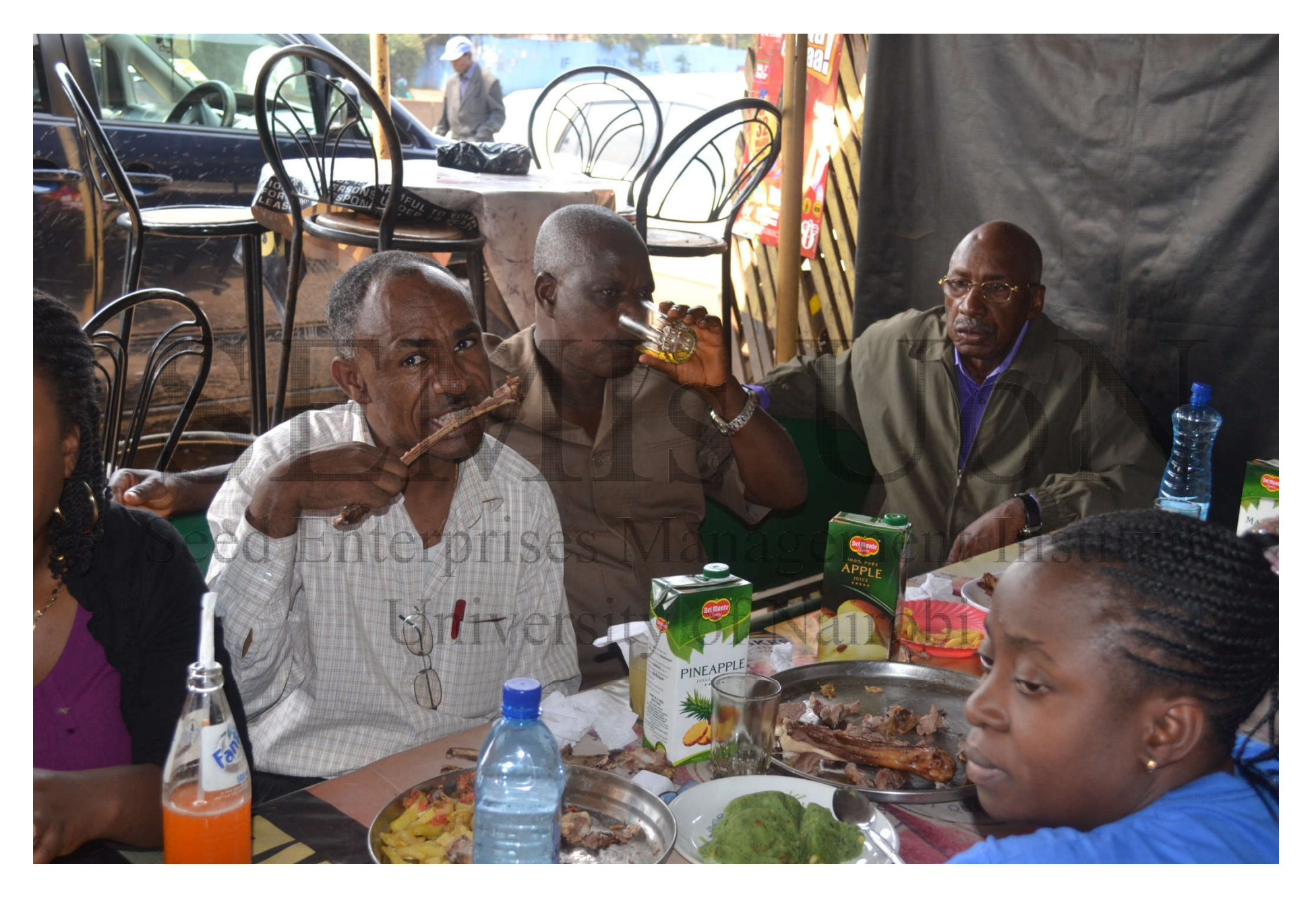
Nyama Choma After a hard week of seed Business