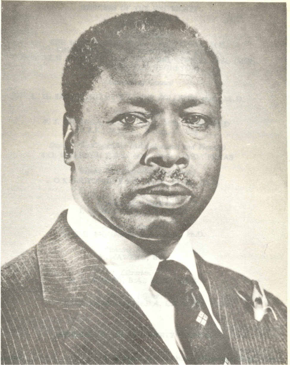
His Excellency the Hon. Daniel T. arap Moi, C.G.H., M.P., HON. LL.D. (NAIROBI), D.Sc. (NEW BRUNSWICK), D.Sc. (MOI), D.ED. (K.U.), D.Sc. (EGERTON), Hon. Ph.D. (Soka) Chancellor of the University of Nairobi and President of the Republic of Kenya and Commander-in-Chief of the Armed Forces