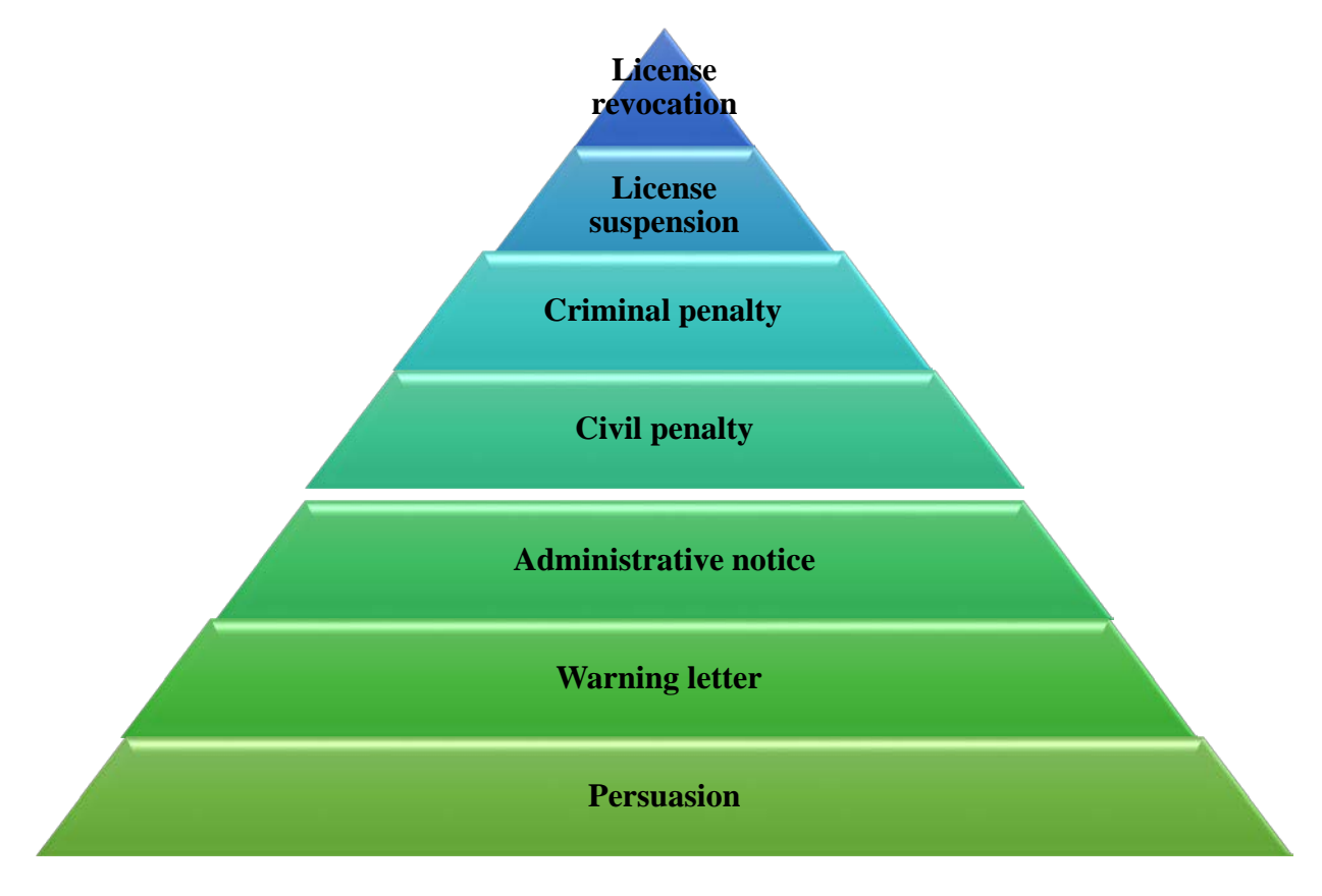
Figure 1: Enforcement pyramid

Source: Peter Drahos, Regulatory Theory: Foundations and applications