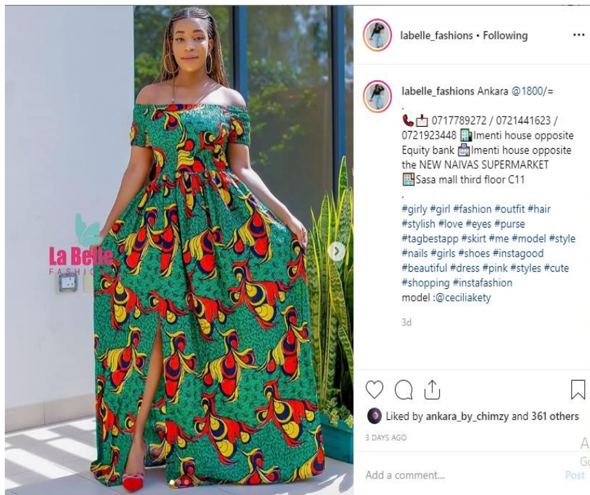
Figure 2.1: An Excerpt of an Instagram advert

With growth in Instagram users globally the companies with renowned brand globally have increased utilisation of the system. Since the launch of Instagram business tool, the number of brand networks has increased by forty six per cent annual from 2015 to the year 2018. Content containing video has taken a lead due to ability of platform to support video. This enables managers of the account to continue engaging the consumers of the advert. The brand network had facilitated thousands of videos by the end of June 2018. Between January and June 2018 video content accounted for 66.2% of all impressions on Instagram which imply that video remains an effective way of promoting products and services on Instagram.