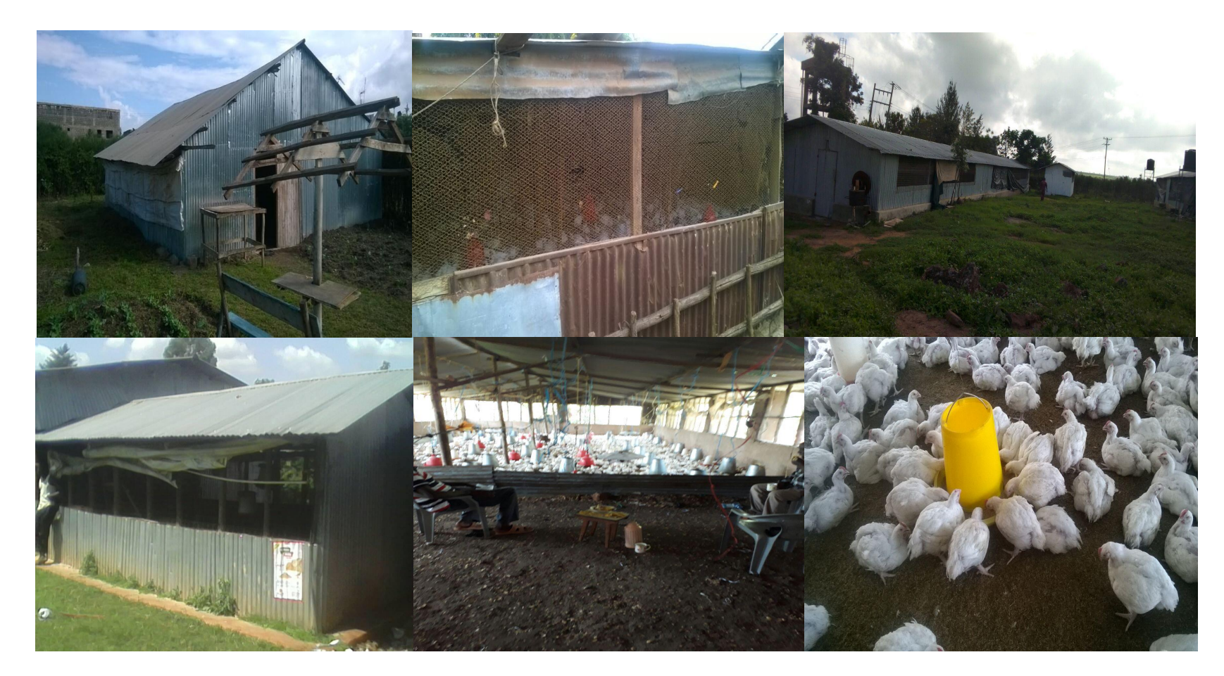
Figure 4.3: Broiler chicken housing showing different types of materials used for construction of walls and roofs and litter