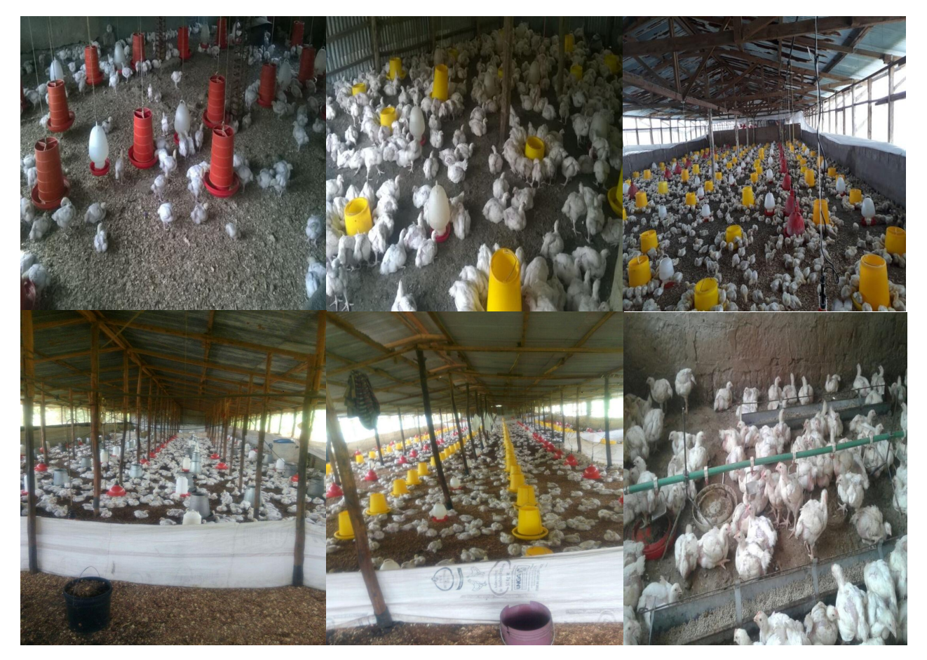
Figure 4.1: Housing showing different types of drinkers and their arrangement alongside available walking spaces for broiler chicken