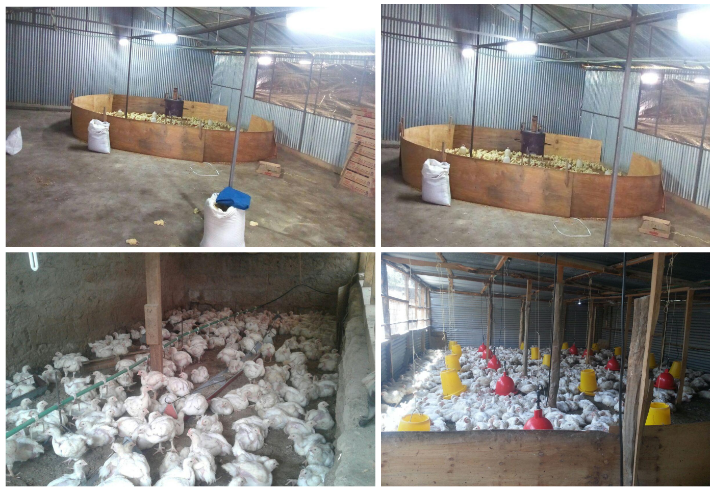
Figure 4.2: Presentation of brooders with broiler chicks and a modified source for heat and mature broilers in different types of housing