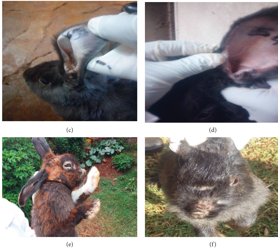
FIGURE 2: A rabbit with psoroptic mange (a) and the same rabbit after successful treatment with ivermectin (b). A rabbit with ear canker before (c) and after (d) treatment with carbaryl. A rabbit with sarcoptic mange around the mouth and nose (e) before treatment and (f) after treatment with liquid paraffin.

demonstrated for plant essential oils [31, 32] and for other plant extracts [33]. In the laboratory trial, carbaryl-liquid paraffin combination recorded the fastest action in clearing mite infestations and associated lesions compared with the use of carbaryl-water combination (as used in field trial), liquid paraffin, and ivermectin. The effectiveness of carbaryl against mites in our study agrees with findings reported by Ebrahimi et al. [34]. However, the labour-intensive nature of this treatment regimen that requires initial wetting of the lesion before carbaryl can be applied coupled by the extra cost of carbaryl may limit its adoption compared with the cheaper use of liquid paraffin alone. Further, carbaryl poses ecological and toxicological concerns that limit its application in control of ectoparasitism. The use of liquid paraffin against rabbit mange should be promoted as it is easily accessible, relatively affordable, has no known side effects, and will contribute to reduction in use of antiparasiticides such as ivermectin and carbaryl, thereby minimising acaricide resistance and accumulation of their residues in animal products.