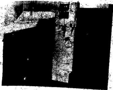
A Cabin of the SS "Ipu"

Her draft is light, and suitable for crossing the Bar at high water of all tides.