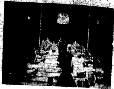
The Saloon of the SS "Ipu"