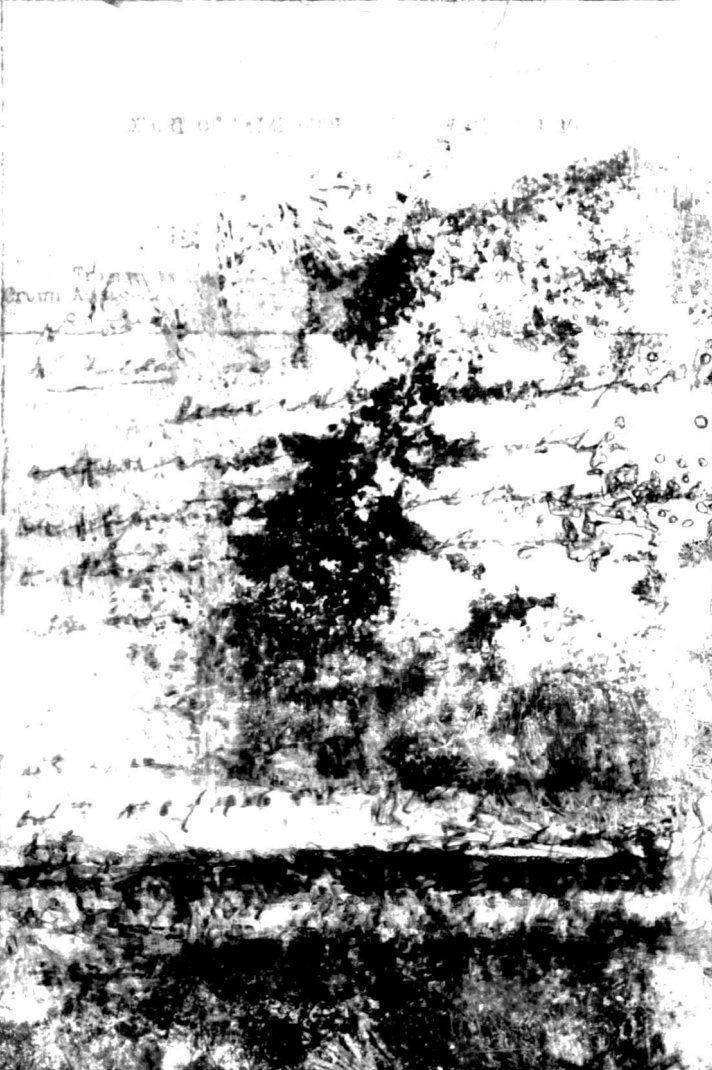
EXHIBIT NO. 2