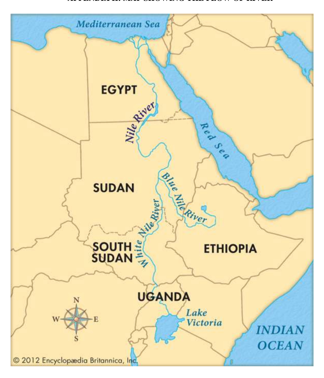
APPENDIX II: MAP SHOWING THE FLOW OF RIVER