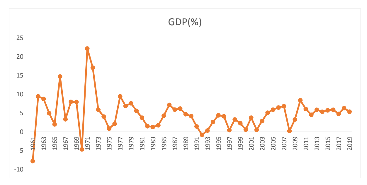
Figure 1: Trend in GDP growth rate for Kenya

Since the implementation of the economic recovery strategies in 2003, Kenya has made big steps in stabilizing her growth. Since then, GDP has been on the rise. For instance, in the year 2000, Kenya's GDP was USD 14.14 billion. As of 2010, GDP was now at USD 40 billion and at the end of 2018, GDP was at USD 89.21. Between 2010 and 2018, GDP in Kenya increased by 123.025 percent showing indicating a great promise in the country' quest for growth. The consistent growth in GDP is shown in the figure below.