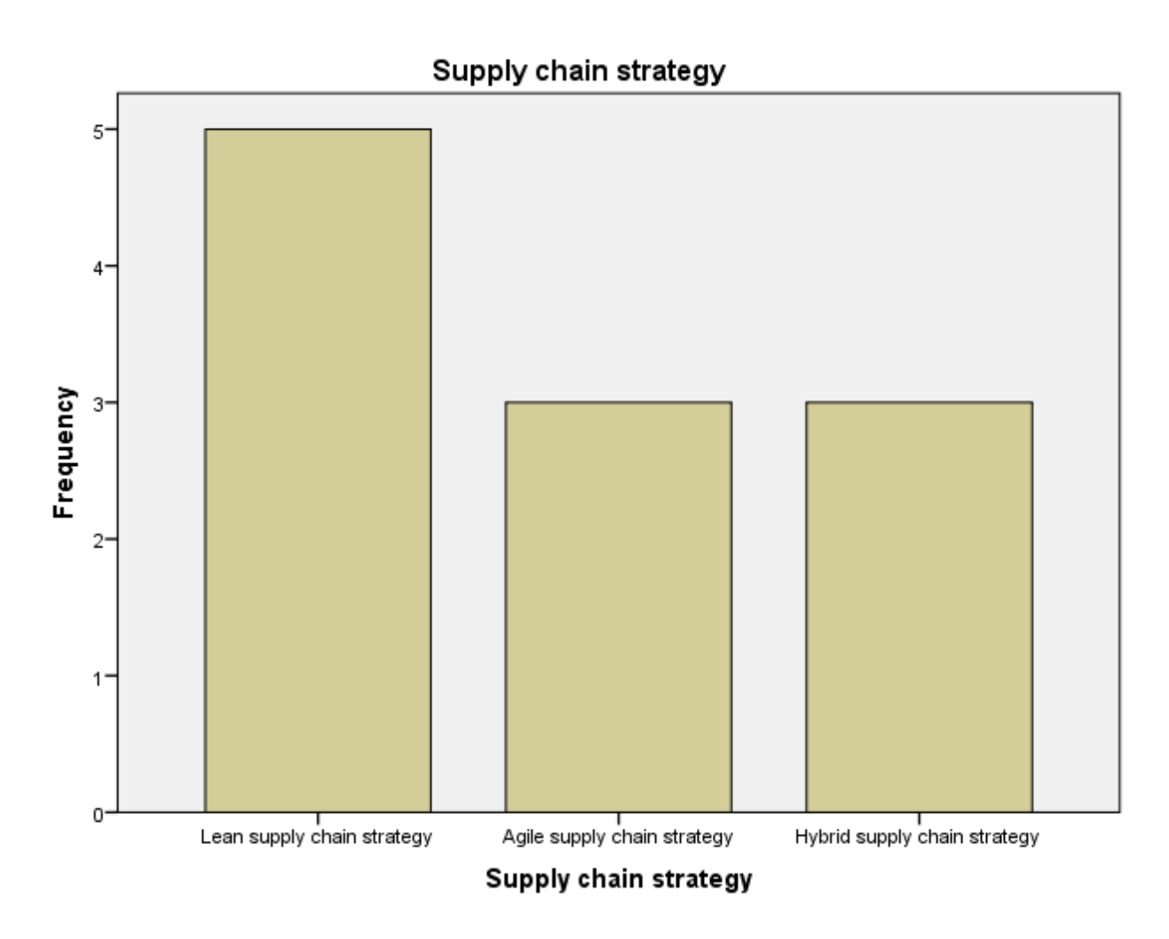
Figure 4.2 Frequency Chart of Supply Chain Strategy

The extent to which Kenya Power employs each supply chain strategy was further elaborated by the bar charts in figure 4.2. The bar charts showed that in a scale of 1-5, the lean supply chain was at five while both the agile and hybrid supply chain strategies were at three.