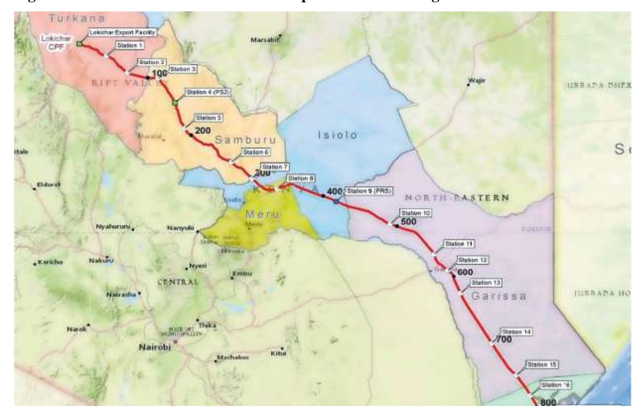
Figure 3.4: Route of Jubal Lokichar Oil Pipeline in Final Design