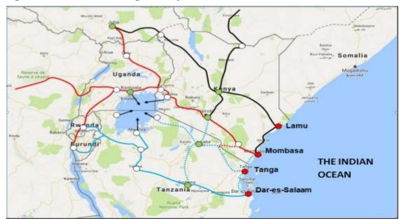
Figure 3.3: The Standard Gauge Railway Route

terms of investment Kenya is still getting more from integration and benefiting a lot in that agenda so we cannot make a mistake of not strengthening our relationships<sup>4</sup>.