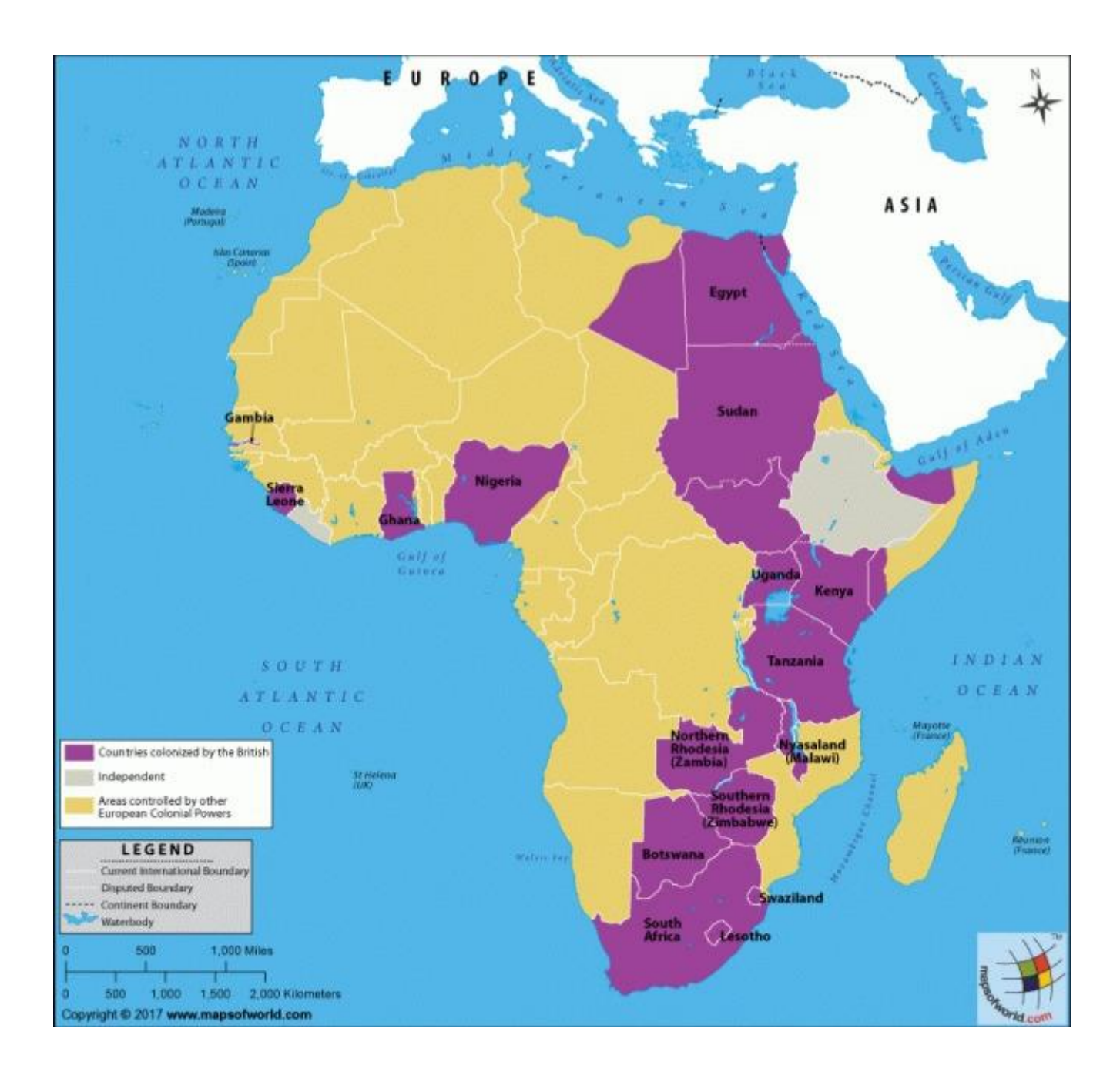
The interplay between socio-economic resources caused the colonizing countries to struggle for and pitch camp on the continent so that they could secure their commercial and military interests. Inter-imperialist moneymaking competition and staking of exclusive territorial claims in particular native countries of interests accelerated this need for exclusive hold onto watercourses and other