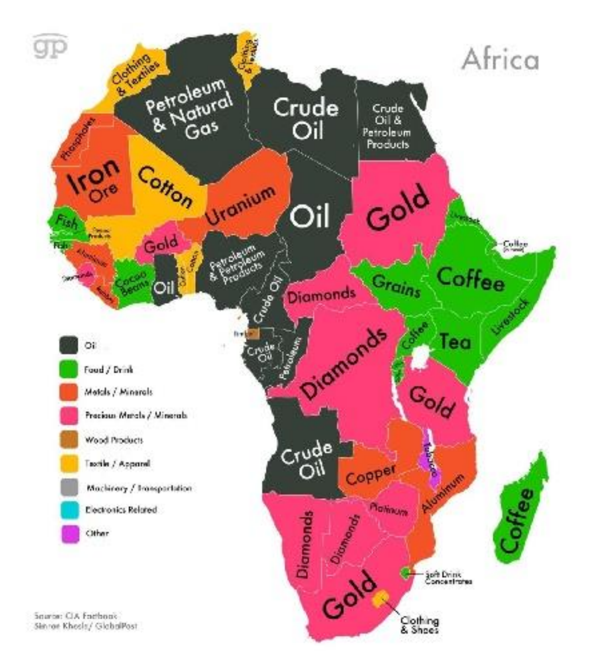
Figure 2.1 Natural Resources that Attracted Colonialists in Africa

resources which attracted the European colonial powers hence leading to what was famously referred to as the scramble for Africa.