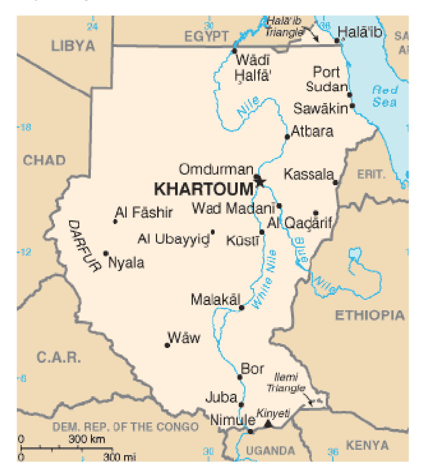
Figure 3.1 Map of Sudan before the secession of the south Sudan