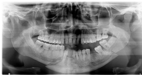
Figure 1. Dental panoramic image showing bilateral mandibular body fractures after IPV.