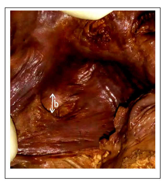
Figure 1. Coronary sinus ostium in the right atrium

wall. a- transverse diameter, b-supero-inferior diameter.