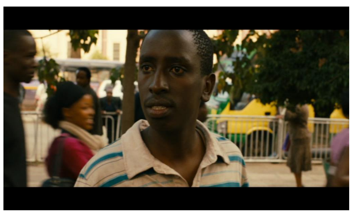
Fig 3.0 Image of Mwas in a point glance shot

film. Once the audience discovers the object of Mwas' gaze a road show truck advertising "The Vultures", the audience remains fixed to the screen to want to find out the outcome.