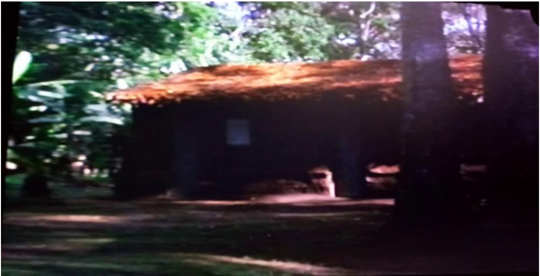
Fig 2.1 Bwana John's servants' quarters

a separate mud walled and thatched hat with huge gaping holes. They have no furniture and are forced to spread a mat on the floor with nothing to cover themselves with. The 'servants' quarters' is nothing but a space to lay one's head.