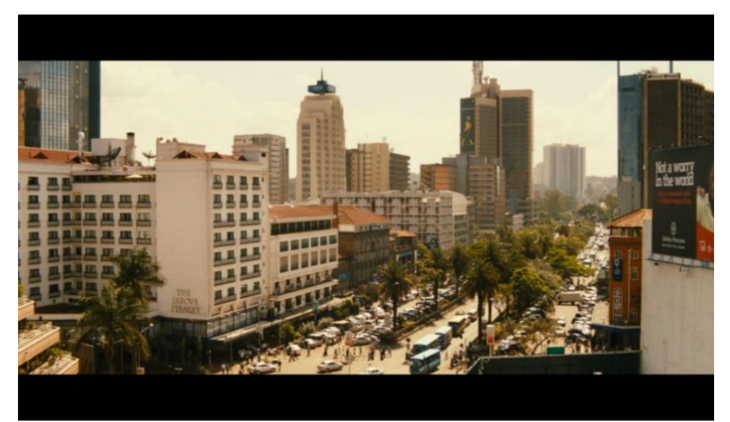
Fig 3.6 The beautiful Nairobi cityscape