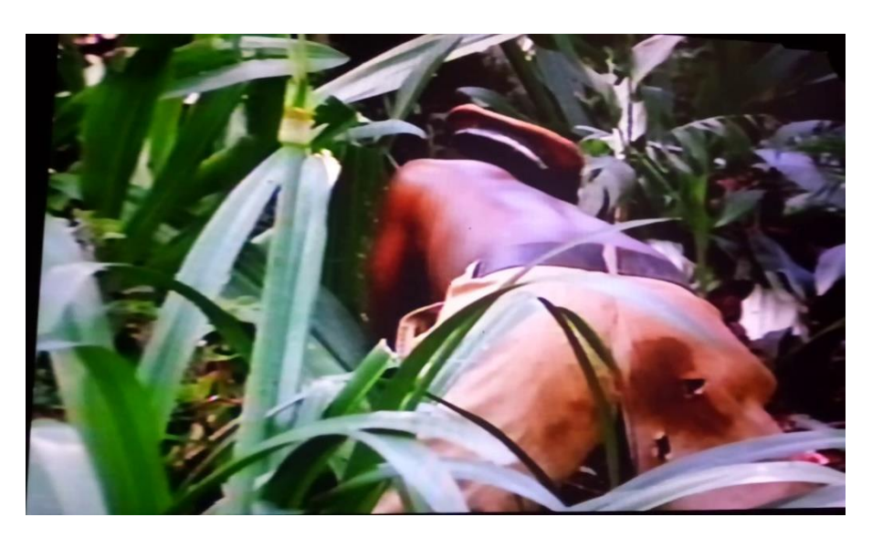
Fig 2.4 A native in tatters digging the ground for earth worms; for food

The colonial subjects' poverty is also seen in the clothes they wear. Mwangi puts on a tattered short, which is contrasted with the clothes the whites wear. Most blacks put on torn shorts or trousers without shirts.