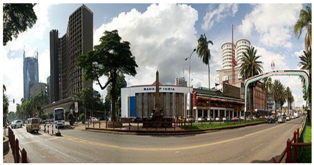
Fig. 3.7 Kenyatta Avenue, Nairobi CBD's main street