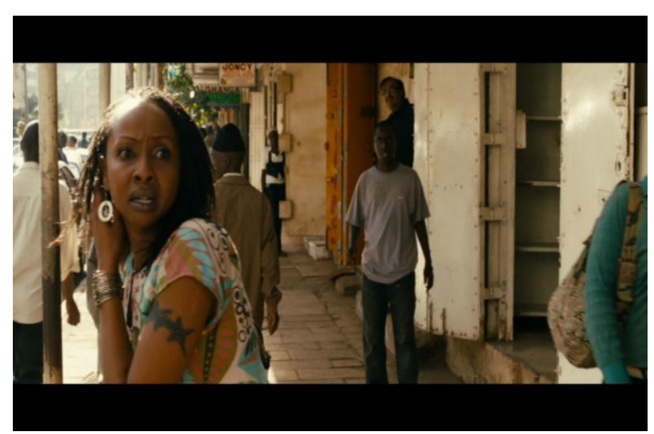
Fig 3.2 Her terror stricken face after her phone is snatched by Oti