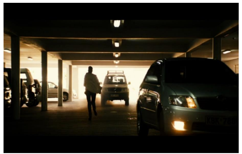
Fig 3.9 The lady chasing after her car on foot

start, the driver to the other car moves creating a barrier between her and her car. She beats the car using her fists for blocking her way and tries to push it out of her way using her hands to the amusement of the audience. As her car speeds off, she desperately tries to wave it to a stop and chases after it on foot. The whole scene is funny. The gang's prowess is captivating. The audience is drawn to the grace of the robbers' actions in the process downplaying the pain of the robbery. This concurs with the argument advanced by the compensatory theorists to the effect that pleasure that is sufficient can offset the pain involved.