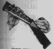
SOCKET WRENCH SETS From Shs. 6/- Various types of Hex and Hex-hat Handles in stock