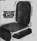
SEAT COVERS From Shs. 7/00 to 14/- each