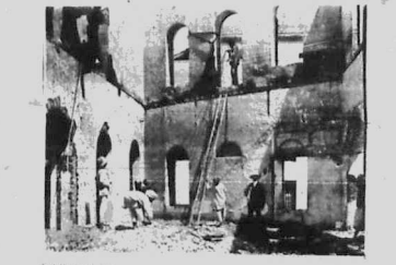
THE P. & D. BORISHING, THE WALL OF THE BURNET HOTEL, KILIMBASSA.