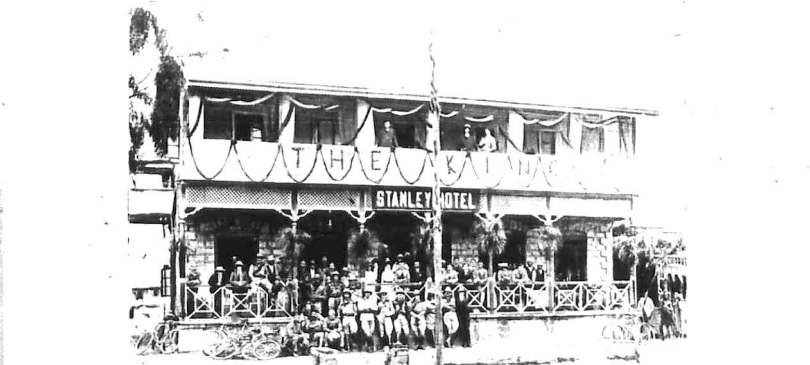
A GROUP OF THE LEGION OF FRONTIERSMEN WHO TOOK PART IN THE CORONATION PROCESSIONS