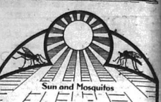
Sun and Mosquitoes