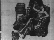
The Complexions of Women of England

New Political Party in the South of Africa. (Continued from page 7.)