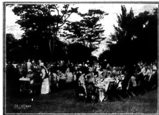
A group in the beautiful Government House grounds. Tea was set for 1,200.