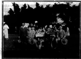
A later Tea Party.