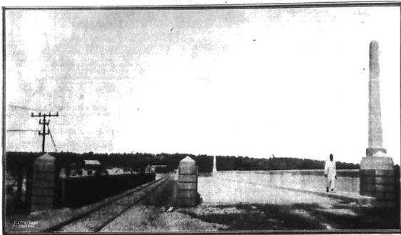
The new Road and Rail Causeway which now links Mombasa Island with the mainland and in places the Subiway Railway Bridge which has done duty for nearly 30 years.