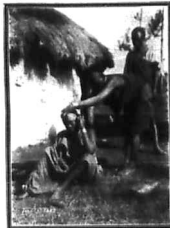
The picture shows a scene of life in Mombasa. On the left, two children (the father and mother) are seen on the left, and on the right, a woman is seen working with a large object.