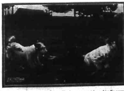
A wondrous story in a Kenya garden. The house puppy brings a friendly approach.