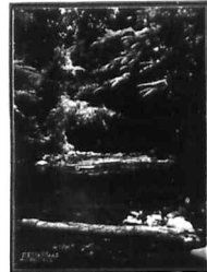
Since the Kenya rivers are stocked with trout week-end fishing holidays have become a popular addition to the Colony's social life. These two photographs suggest the delightful surroundings of the sport in Kenya. On the left, the Tana fishing camp and on the right a trout pond on the Malindi River.