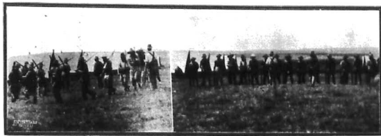
The Ken. army under the Kenya Defence Force banner was first recruited at Thompson Falls to offer a number of the men in the younger age groups in the District a chance of white training under arms. The army was a great success. The above two photographs convey an impression of the atmosphere.