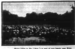
Water Lilies in the "blue" - a spot of rare beauty near Kisumu.