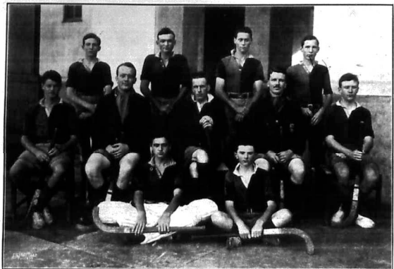
Nairobi School Hockey 1st XI