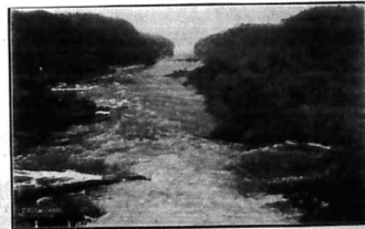
The Meridian Falls where the Nile rushes over the Escarpment into Lake Albert.