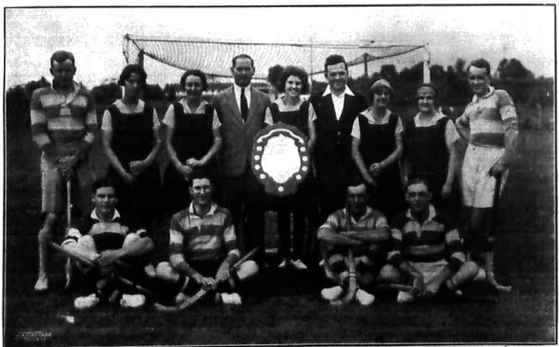
The Muthaiga Hockey Team, winners of the May Shield.