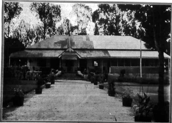
AFTER TWENTY-FIVE YEARS.

The Ogan Institute, Entebbe, which celebrated the Silver Jubilee of its foundation last month.