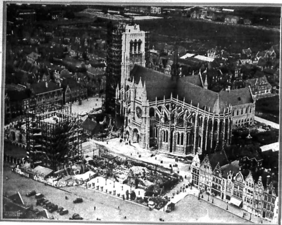
THE NEW YVES.

Repeating the Cathedral at Ypres. An aerial view of the town showing the new Cathedral of St. Martin built in the same Gothic style as the ruins of the old building destroyed by which it was during the war. In the foreground are the ruins of the Cloth Hall.