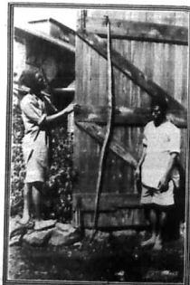
AN UNWELCOME VISITOR.

Black Mamba, ten feet long, which was found recently entering a house on the Mt. Kenia.