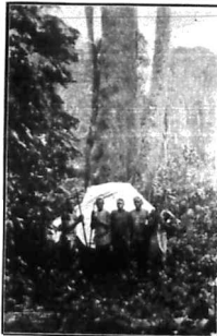
THE MOUNTAINS OF THE MOON.

Photographs of a woman in the Mt. Kenya Range on the Uganda-Congo border. Left: Shanty, and a temporary shelter from a storm, on the forest near Elgon. Right: A stream near Elgon.