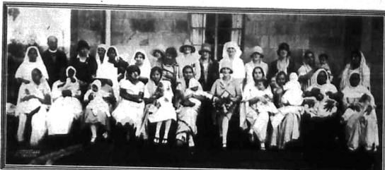
THE NAIROBI MATERNITY CENTRE.