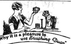
"Why it is a pleasure to use Brushing Duo "

Insurance Company Oldest Scottish Insurance Office, FOUNDED IN 1805. PRINCIPAL REPRESENTATIVES— R. A. HAMILTON, Ltd., Box 203 NAIROBI Phone 2352.