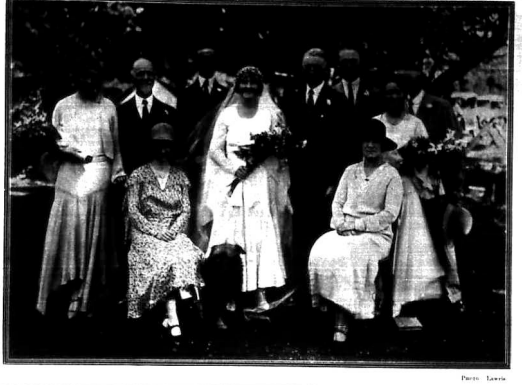
The wedding party at the Wilson-Beverley wedding.