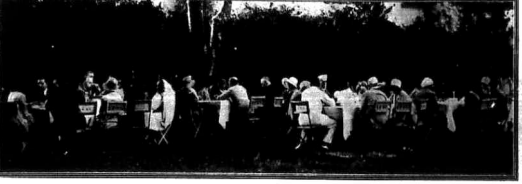
The Lawford-Bumpus wedding.