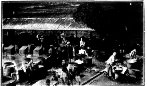
When a great deal of Maucha's laundry is washed.