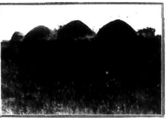
The ruins of Kiwa Kiswani, in the district of Kiwa, are the remains of a city which was built by the Persians in the 5th century B.C. The ruins are in a state of great preservation, and are of great interest to the student of ancient architecture.