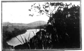
A glimpse of Nalhi Creek Lake at Nakuru.