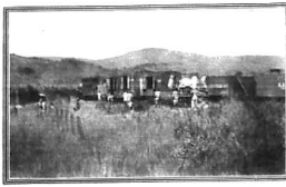
The lowest trees in Nakuru at Nakuru.