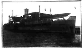
The St. Robert's grounds at Nakuru.