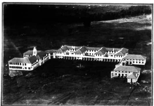
An aerial picture of the new Government School for European boys at Kabete, near Nairobi.