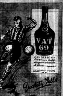
The African Mercantile Company Ltd. NAIROBI