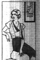
For the afternoon, this of... with these suit bands.