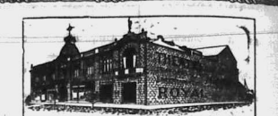
NAIROBER PREMIER THEATRE. (FULLY RECONSTRUCTED)

ing the rail for it. I went into some of these from which, about 100,000 tons of a wide section of the front, will be necessary. Everything is here for them. Heavy boats for carrying light boats for transport, wireless telegraph, and other things, are being sent to the front. It has already done for it.