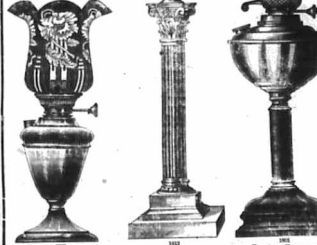
Re. 22-50 Duplex Burners All Brass with round Burner (complete). Re. 22-50 Duplex Burners All Brass with Tinted Glass Burner, (complete).