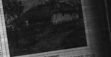
K. A. Standard Press

The Meritini Rubber Estates Ltd. is a company that has been established in the rubber country. The company has been established in the rubber country. The company has been established in the rubber country.