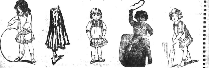
Children's Washing Cotton Frocks Ladies' T. Sets or Rain Undergarments White Broadcloth Men's Frocks B-310 Striped Cotton Overalls Loose Mague overall similar to sketch similar to sketch. Usual prices Rs. present fabrics at greatly reduced all sizes. Usual prices Rs. 5, 4, blue, grey and white all sizes, without belt. Strong cotton washing dress price Rs. 4-95. Sale price Rs. 2-50. Sale price Rs. 1 25 to 2 0. 2-50, 2-90. Sale price Rs. 1.00.

We give below a few representative bargains. The counters and showrooms in our Ladies' and Childrens' Departments will be packed with equally attractive values.