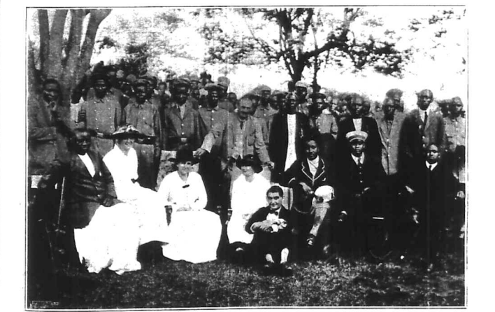
A public meeting of citizens being arranged in Mombasa.