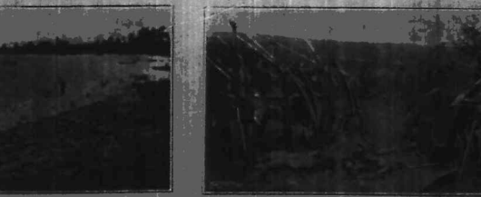
STORY PHOTO OF THIS PAGE HAS RECEIVED A PRIZE SEE OUR SNAPSHOT COMPETITION ADVERT. ON PAGE 16