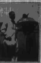
THE FIRST BLOW