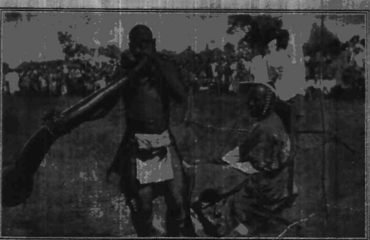
A COMMAND PERFORMANCE A Band playing 'The Last Chord' on an instrument made from the horn of a Uganda cow. The artist who ordered the music is apparently enjoying it.