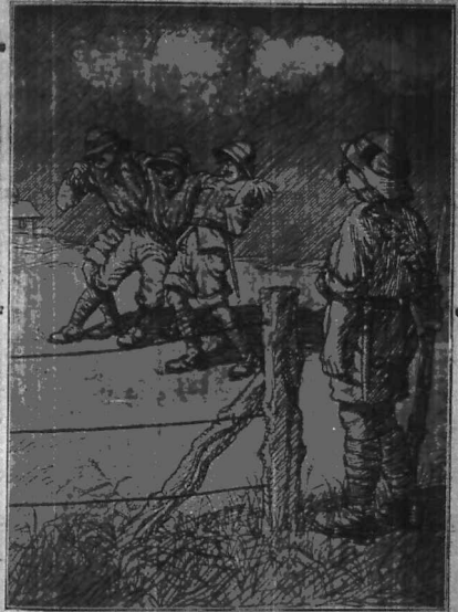
Illustration showing a group of people in a field, possibly related to the news articles.

London, Feb. 29. M. Clemenceau has issued a statement regarding the situation in the Baltic States.