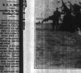
KAIVINDO WARRIOR ON A RIDING BULLOCK.

Forest life in East Africa.