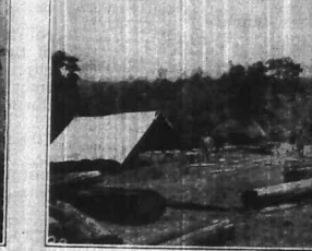
THE BEST NATIVE HUNTERS OF EAST AFRICA.