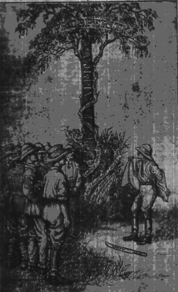
The cartoon depicts the 'Drought Has Broken' and the 'Toll of War'.