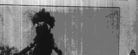
FORREST LIFE IN EAST AFRICA.