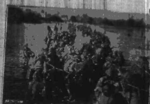
K. M. S. AND INDIAN MOUNTAIN BATTERY CROSSING THE LAJENDA RIVER