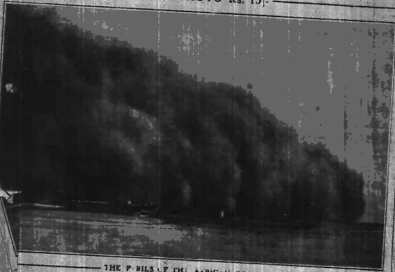
THE P. BILLS OF THE AFRICAN DEPART

A Sandstone near the center form of Khartoum.