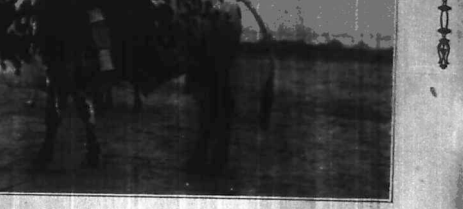
A KAVIRIYONDO WARRIOR ON A RIDING BULLOCK.