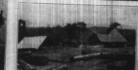
A MOVING INCIDENT. A possible snapshot of a wounded wildcat chasing a porcupine.