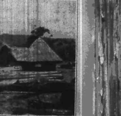
A PARTY OF WANDERERS, THE BEST NATIVE HUNTERS OF EAST AFRICA.

Forest life in East Africa.