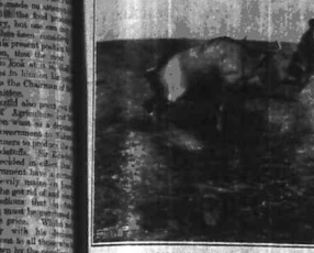
A PARTY OF WANDERERS, THE BEST NATIVE HUNTERS OF EAST AFRICA.