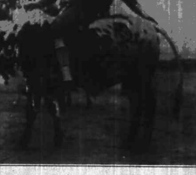
KAIVINDO WARRIOR ON A RIDING BULLOCK.

A moving incident. A snapshot of a wounded wildcat clinging to a porcupine. Photo: Phoebe D. Swazey, Kisumu.