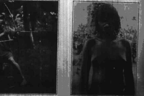
A PARTY OF WANDERBO, THE FIRST NATIVE HUNTERS OF EAST AFRICA.