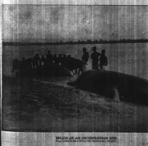
RELIQS OF AN AN IDILUVIAN AGE. Hippo killed in East Africa, the Sportsman's Paradise.